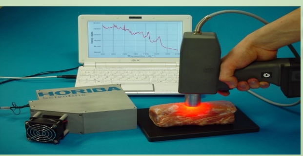
Figure 2 is an example of an actual laser product being used to measure the quality of a meat product.

Figure 1 is a diagram of a blueprint of exactly how the procedure works and the difference between both contaminated and fresh chicken breast