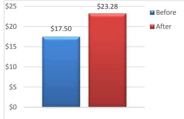
Figure 4. Earnings before studies/training and after

• Respondents were asked what impact their coursework had on their employment. Here are the reasons, listed in rank order of frequency: