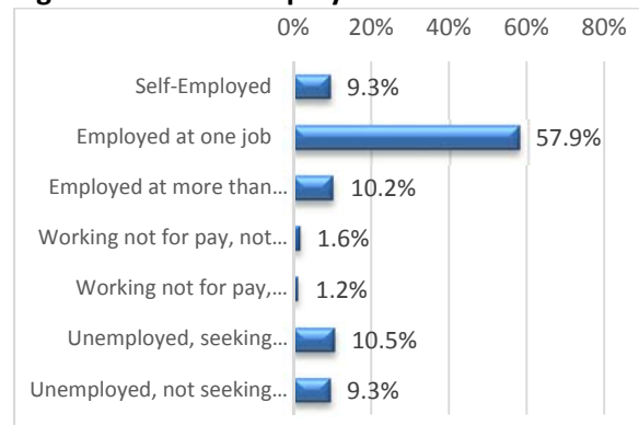
Figure 2. Current Employment Status

• Overall, statewide, students who transferred have 1.7 times the likelihood of being unemployed and not seeking employment (7.3% for not transferring vs. 12.2% for transferring), likely because they are enrolled at a four year institution.