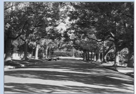
Video image from student film “911”.