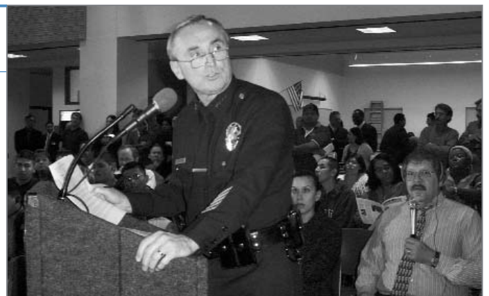
LAPD Chief William Bratton addresses the Los Angeles City Council in most recent of several community events held in Campus Center. The meeting drew an estimated 450 people.

If this is what having Campus Center back has meant so far, can you imagine the vitality of this college in a few years when we complete a media arts center, a fitness center, a culinary arts center and other projects identified under propositions A and 47. I, for one, can hardly wait.