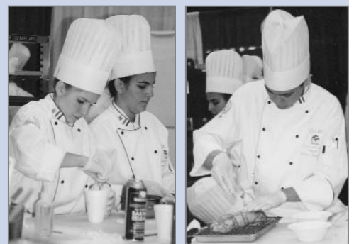
Mission culinary students earn third place in national competition held in Las Vegas.